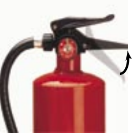
Align valve handle parallel to lever

Connect nozzle to dry chemical recovery system and depressurize the extinguisher.