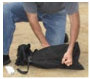
Fasten straps keeping hose out