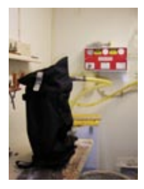
Ensure extinguisher remains in containment bag during dry chemical recovery